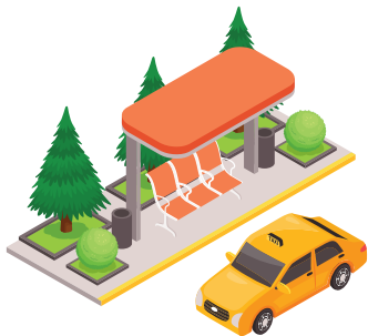
TAKE A TAXI