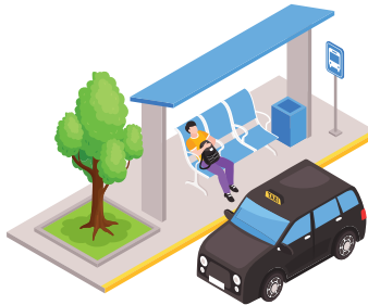
WAITING FOR BUS