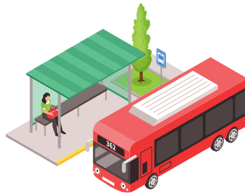
CITY BUS STOP